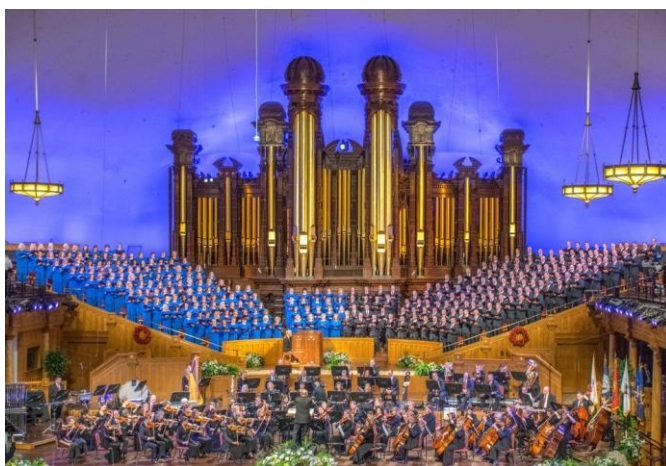
Mormon Tabernacle Choir

Downtown. Visit Temple Square and hear the Mormon Tabernacle Choir rehearsals on Thursday evening or a live broadcast if you're here on Sunday morning. Stop by the beautiful City Library , hear the Utah Symphony play Raiders of the Lost Ark , or rent a Green Bike and check out the area on two wheels!