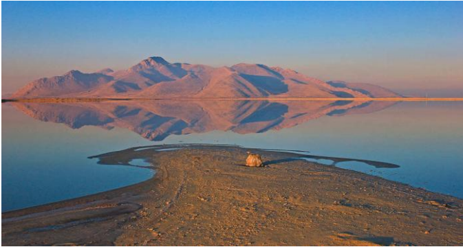
Great Salt Lake

Coming for the weekend? Go for a hike or ride in or around Salt Lake (the largest salt water lake in the Western Hemisphere), or choose from many hikes elsewhere in Utah. You're a just short drive from Park City , Deer Valley, and Snowbird resorts. If you have the time, you're only a few hours from amazing national parks - Arches, Capitol Reef, and Canyonlands. And if you're bringing the family for Labor Day weekend, don't miss the amazing Sheep Dog Championship in nearby Heber Valley