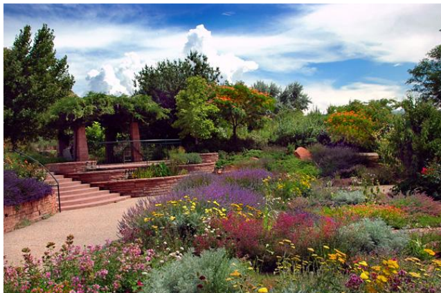
Red Butte Garden

While you're in Salt Lake City, plan to see some of the wonderful sites and surrounding areas.